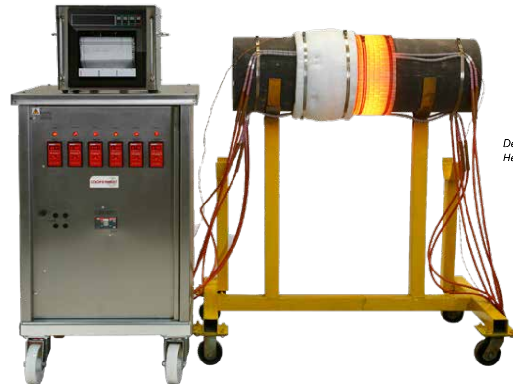
Demonstration of Heat Treatment set up

There are a variety of application methods for heat to weld geometries in order to achieve the desired temperature, ranging from locally applied electrical heaters, to larger gas fired furnaces. The method used is usually determined by the fabrication geometry, size, access restrictions and site constraints.