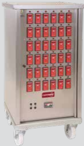
36 Channel Unit

As new techniques develop, new challenges are faced. Therefore, new procedure, techniques and product development is a priority for Cooperheat in order to meet the future requirements of industry. Globally recognised as innovators in thermal technology, Cooperheat are experts within this highly specialised field and can offer the widest spectrum of consultancy services.